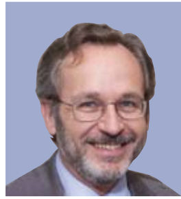
PHILIPPE KRUCHTEN (Canada)

In this interactive workshop, participants will learn how to create a work climate where Agile and traditional teams can accomplish “the job” for the organisation – delivering business value. Building on current practices, we'll explore ways to optimise four factors in the work climate: motivation, environment, support and trust.